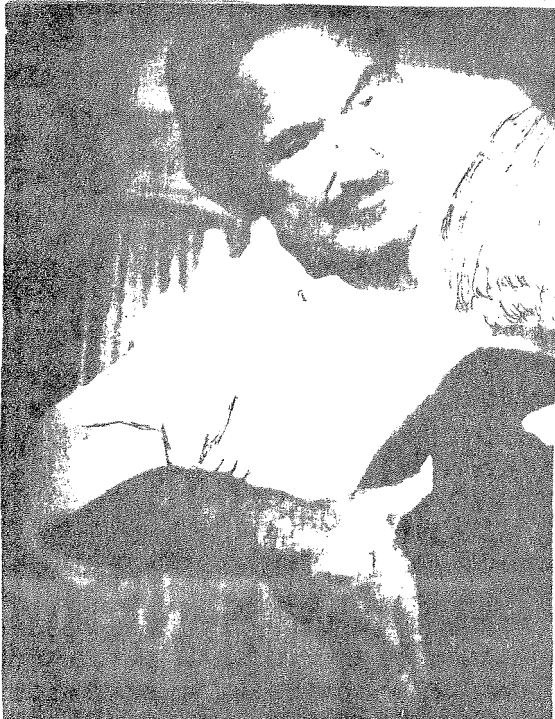
TESTER AND A PATIENT

people remember all the things they might have done. They recall the times they could have behaved better, been kinder, shown more understanding. Now it is too late. The guilt and remorse are coloured by self-pity, by grief, by denial and the modern equivalent of sackcloth and ashes.